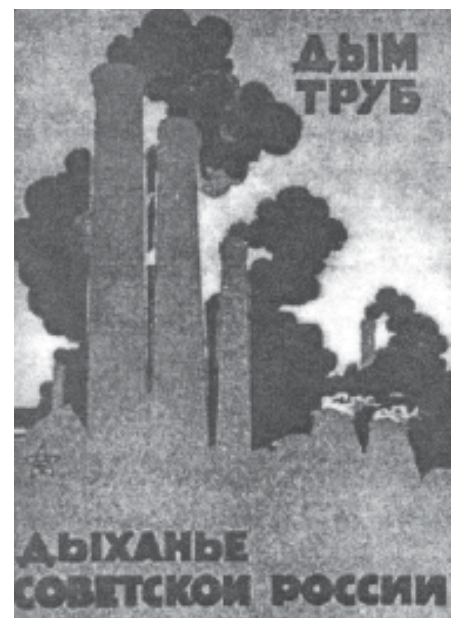
Fig. 14 – Factories came to be seen as a symbol of socialism. This poster states: 'The smoke from the chimneys is the breathing of Soviet Russia.'

An extended schooling system developed, and arrangements were made for factory workers and peasants to enter universities. Crèches were established in factories for the children of women workers. Cheap public health care was provided. Model living quarters were set up for workers. The effect of all this was uneven, though, since government resources were limited.