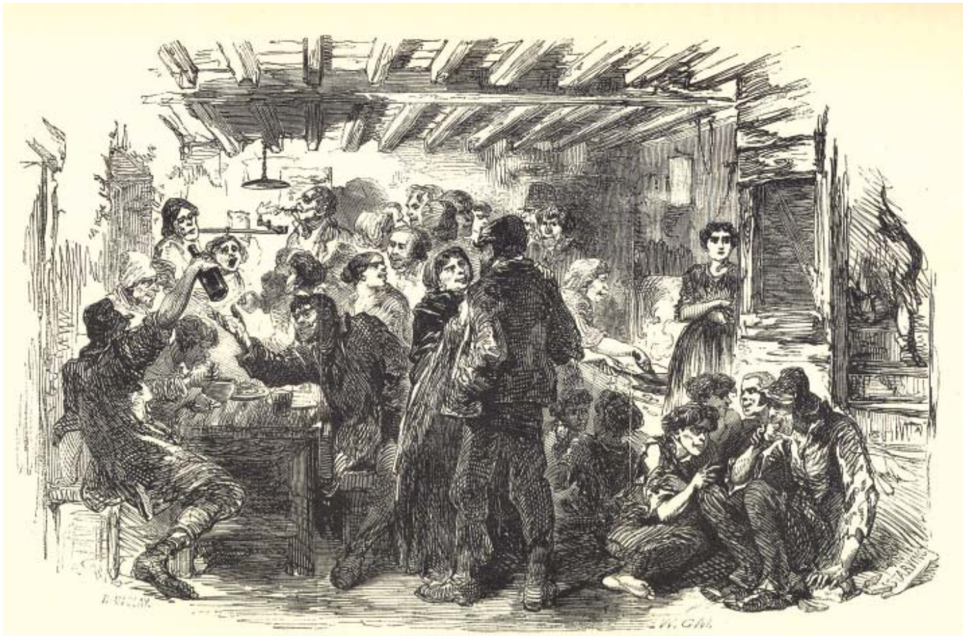
Fig. 1 – The London poor in the mid-nineteenth century as seen by a contemporary.

From: Henry Mayhew, London Labour and the London Poor , 1861.