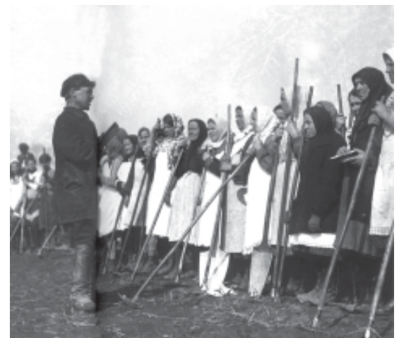
Fig. 19 – Peasant women being gathered to work in the large collective farms.