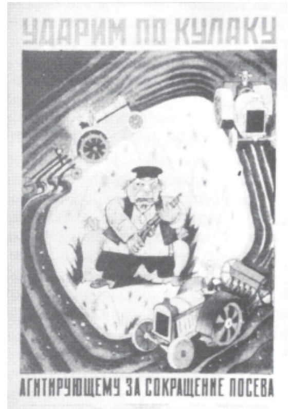
Fig. 18 – A poster during collectivisation. It states: 'We shall strike at the kulak working for the decrease in cultivation.'

Exiled – Forced to live away from one's own country.