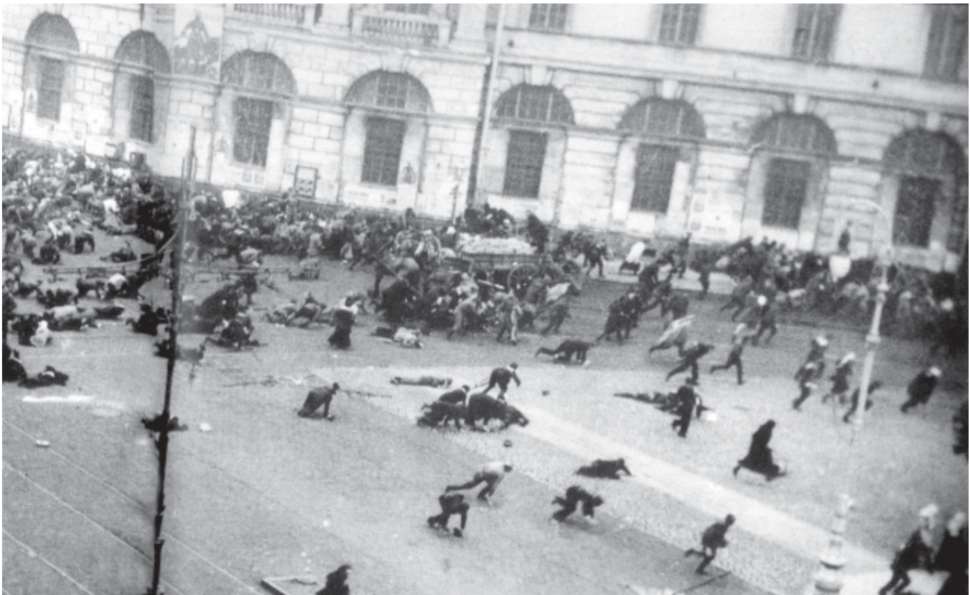
Fig.10 – The July Days. A pro-Bolshevik demonstration on 17 July 1917 being fired upon by the army.