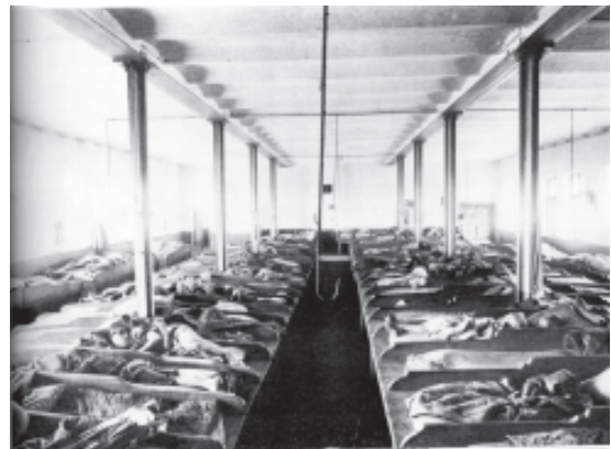
Fig.6 – Workers sleeping in bunkers in a dormitory in pre-revolutionary Russia.

Many survived by eating at charitable kitchens and living in poorhouses.