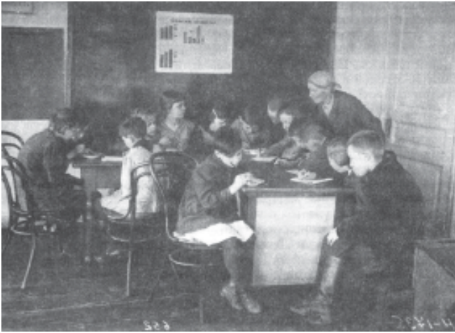
Fig. 15 – Children at school in Soviet Russia in the 1930s. They are studying the Soviet economy.