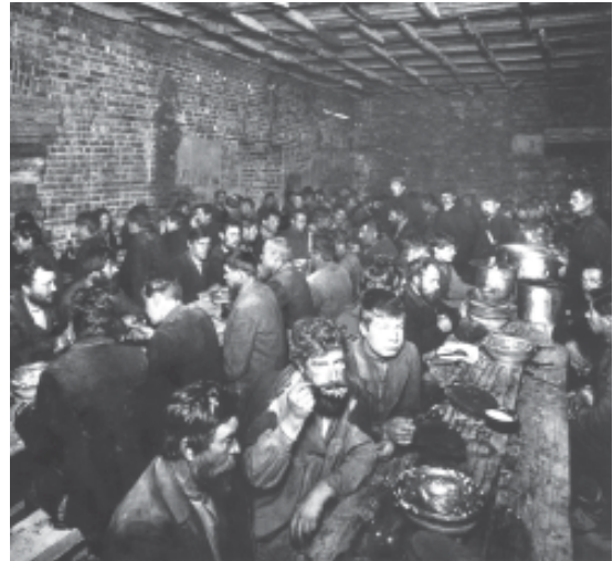
Fig.5 – Unemployed peasants in pre-war St Petersburg.

In the countryside, peasants cultivated most of the land. But the nobility, the crown and the Orthodox Church owned large properties. Like workers, peasants too were divided. They were also