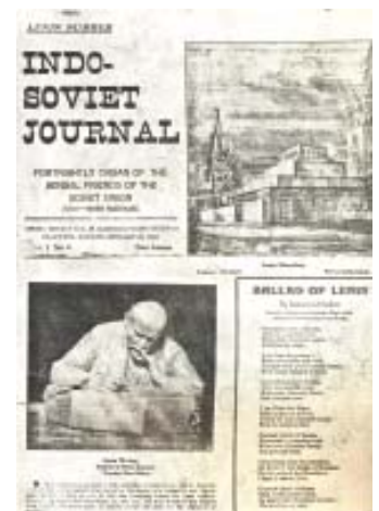
Fig. 20 – Special Issue on Lenin of the Indo-Soviet Journal. Indian communists mobilised support for the USSR during the Second World War.