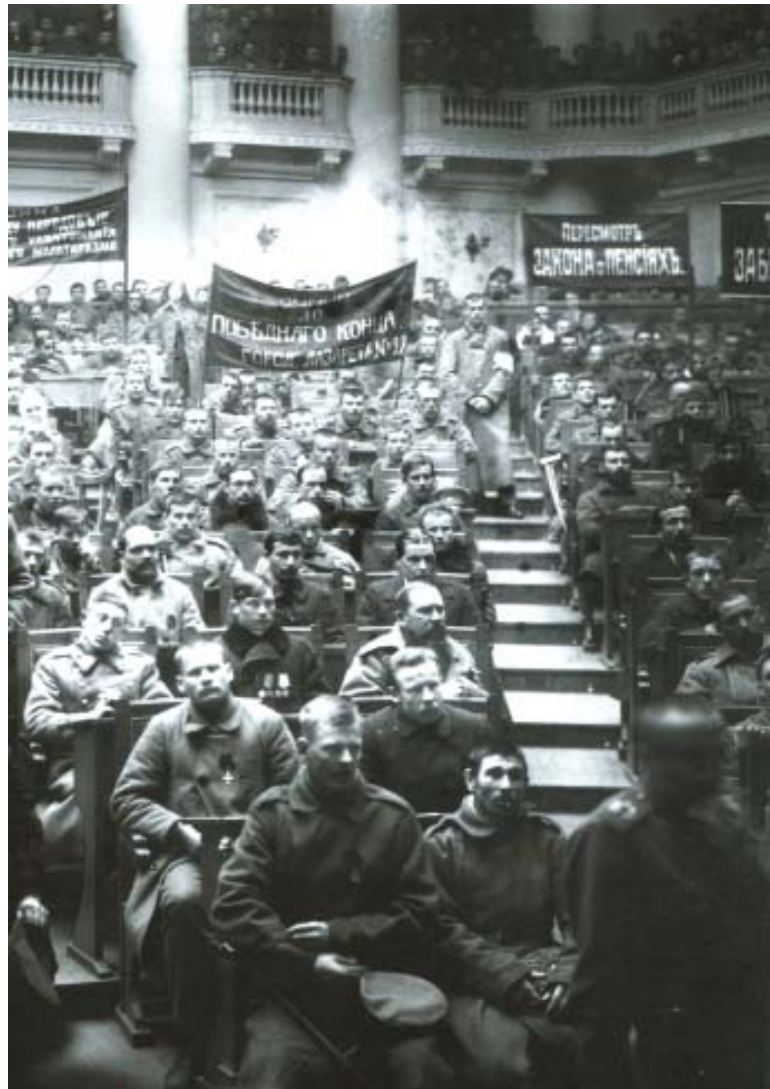
Fig.8 – The Petrograd Soviet meeting in the Duma, February 1917.

On Sunday, 25 February, the government suspended the Duma. Politicians spoke out against the measure. Demonstrators returned in force to the streets of the left bank on the 26th. On the 27th, the Police Headquarters were ransacked. The streets thronged with people raising slogans about bread, wages, better hours and democracy. The government tried to control the situation and called out the cavalry once again. However, the cavalry refused to fire on the demonstrators. An officer was shot at the barracks of a regiment and three other regiments mutinied, voting to join the striking workers. By that evening, soldiers and