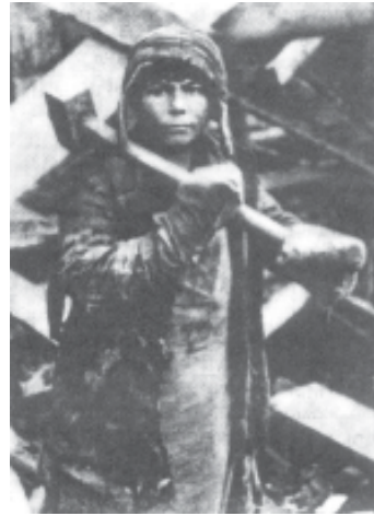
Fig. 16 – A child in Magnitogorsk during the First Five Year Plan. He is working for Soviet Russia.