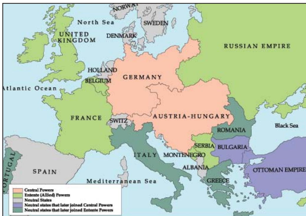
Fig.4 – Europe in 1914.

The map shows the Russian empire and the European countries at war during the First World War.