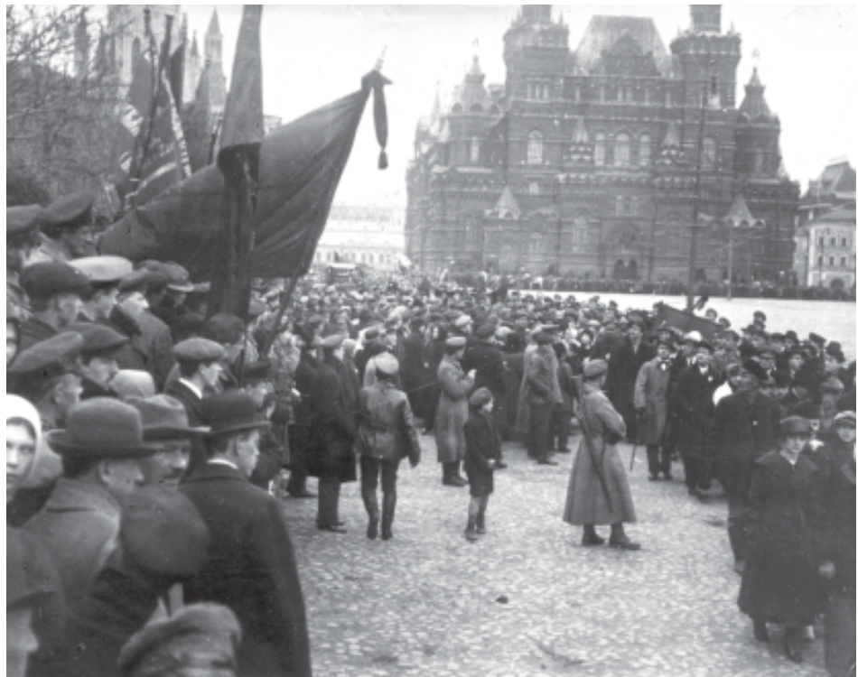
Fig. 13 – May Day demonstration in Moscow in 1918.