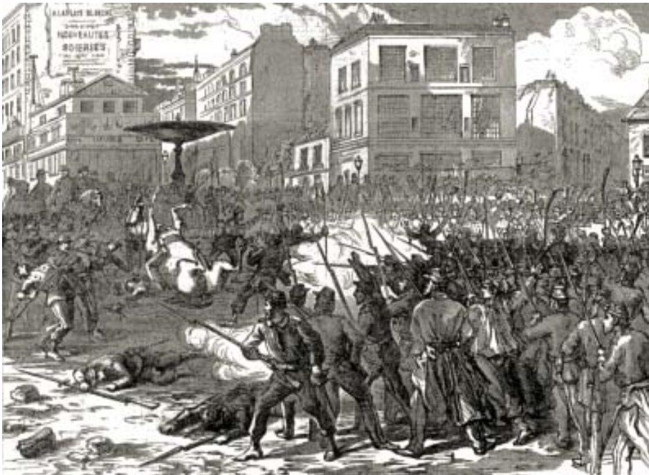
Fig.2 – This is a painting of the Paris Commune of 1871 (From Illustrated London News, 1871). It portrays a scene from the popular uprising in Paris between March and May 1871. This was a period when the town council (commune) of Paris was taken over by a ‘peoples’ government’ consisting of workers, ordinary people, professionals, political activists and others. The uprising emerged against a background of growing discontent against the policies of the French state. The ‘Paris Commune’ was ultimately crushed by government troops but it was celebrated by Socialists the world over as a prelude to a socialist revolution. The Paris Commune is also popularly remembered for two important legacies: one, for its association with the workers’ red flag – that was the flag adopted by the communards (revolutionaries) in Paris; two, for the ‘Marseillaise’, originally written as a war song in 1792, it became a symbol of the Commune and of the struggle for liberty.