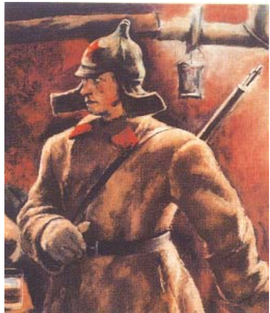
Fig. 12 – A soldier wearing the Soviet hat (budeonovka).

at Brest Litovsk. In the years that followed, the Bolsheviks became the only party to participate in the elections to the All Russian Congress of Soviets, which became the Parliament of the country. Russia became a one-party state. Trade unions were kept under party control. The secret police (called the Cheka first, and later OGPU and NKVD) punished those who criticised the Bolsheviks. Many young writers and artists rallied to the Party because it stood for socialism and for change. After October 1917, this led to experiments in the arts and architecture. But many became disillusioned because of the censorship the Party encouraged.