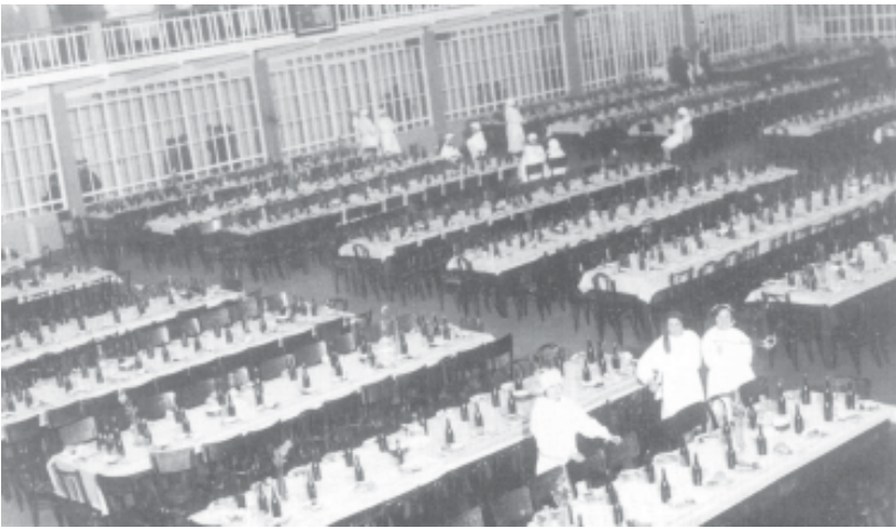
Fig. 17 – Factory dining hall in the 1930s.