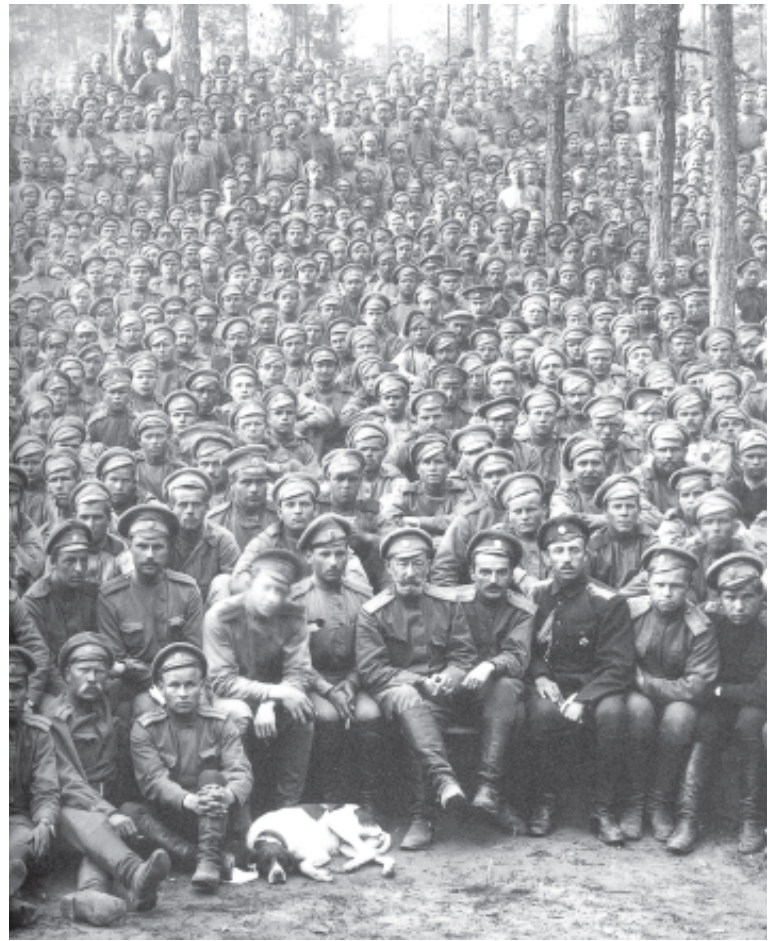
Fig. 7 – Russian soldiers during the First World War.

The war also had a severe impact on industry. Russia's own industries were few in number and the country was cut off from other suppliers of industrial goods by German control of the Baltic Sea. Industrial equipment disintegrated more rapidly in Russia than elsewhere in Europe. By 1916, railway lines began to break down. Able-bodied men were called up to the war. As a result, there were labour shortages and small workshops producing essentials were shut down. Large supplies of grain were sent to feed the army. For the people in the cities, bread and flour became scarce. By the winter of 1916, riots at bread shops were common.